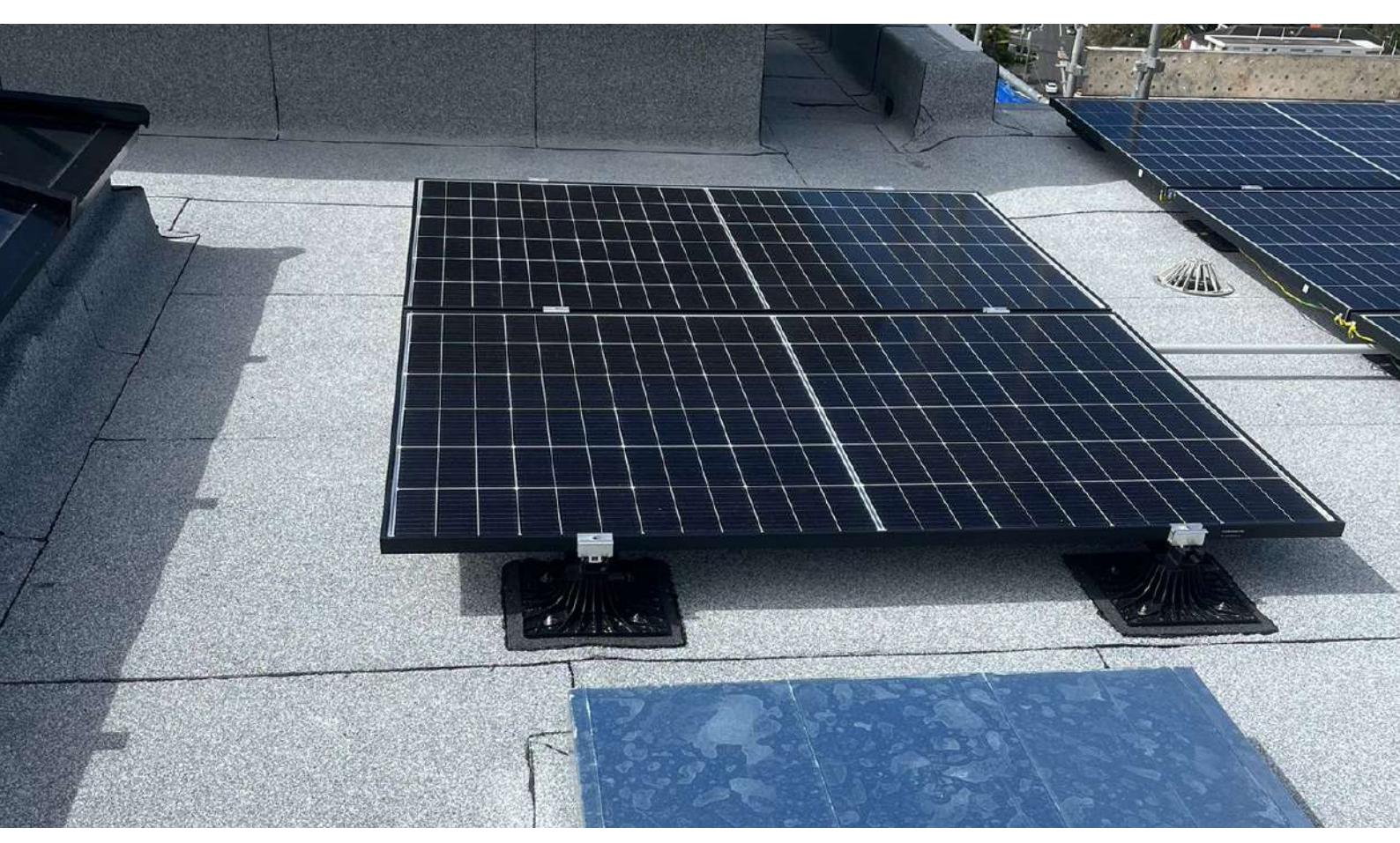
Panels installed on Enduroflex DuO Solar