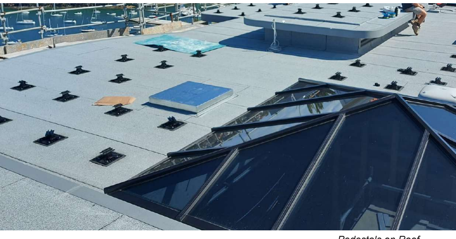
Pedestals on Roof