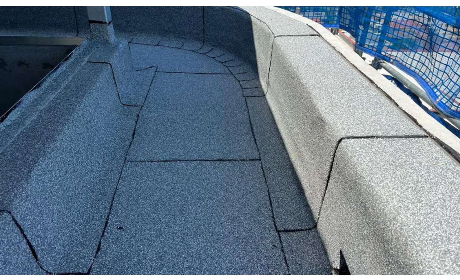
Waterprooifng Membrane installed