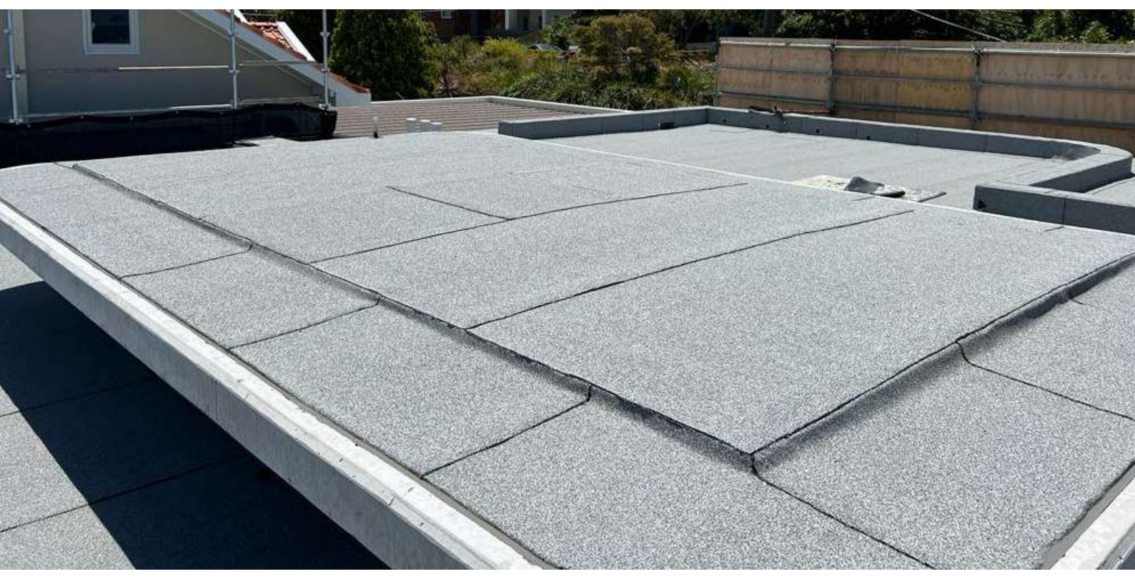
Waterprooifng Membrane installed