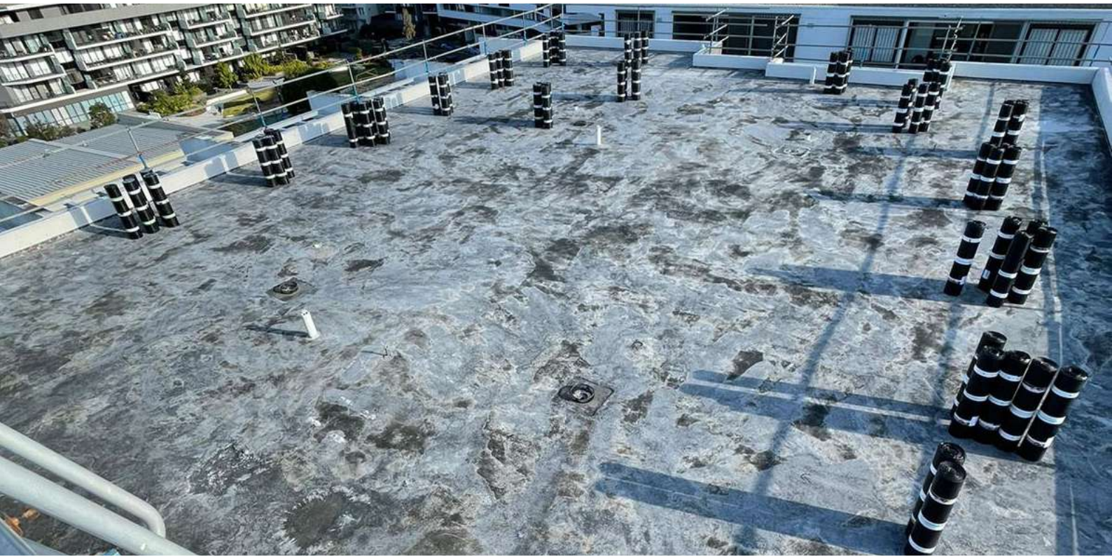
Prior to commencement