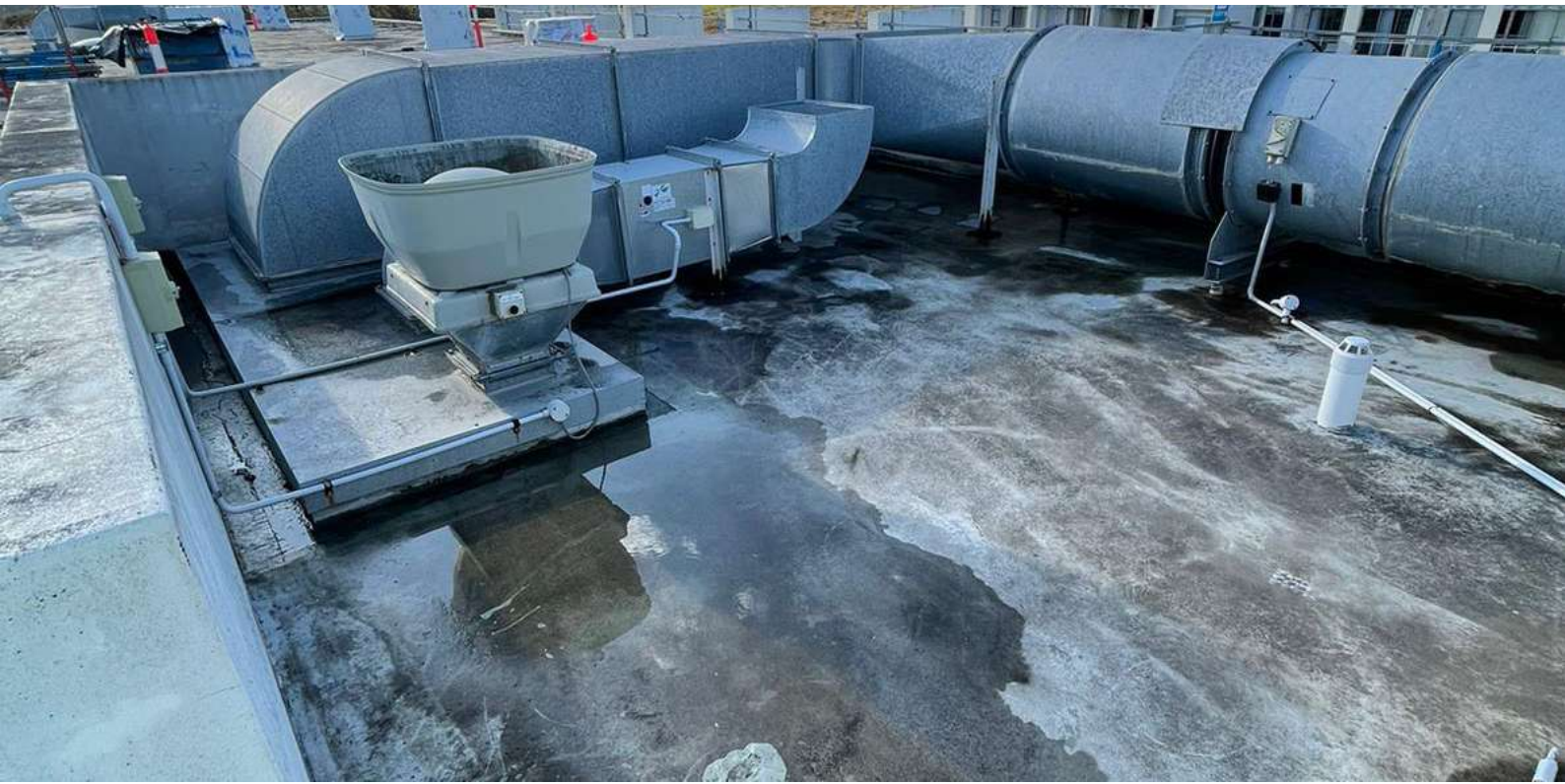
Preparation for Installation