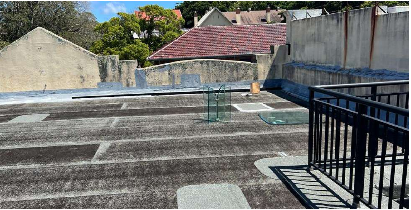
Prior to commencement