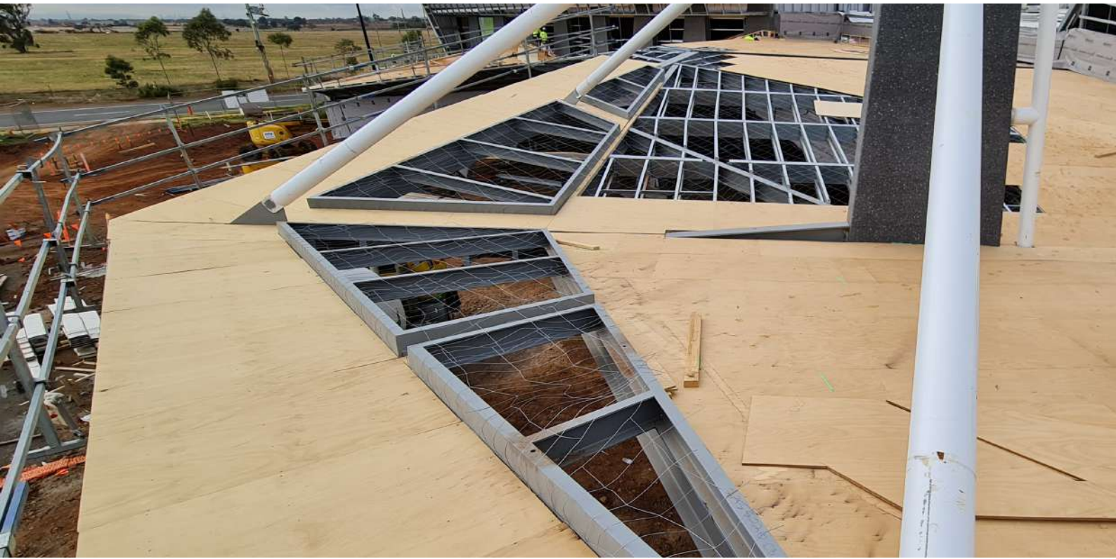
Prior to commencement